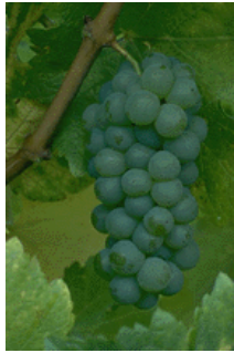
CAPTION DESCRIB- ING PICTURE OR GRAPHIC.

THE MOST IMPOR- TANT INFORMA- TION IS IN- CLUDED HERE ON THE INSIDE PAN- ELS. USE THESE PANELS TO IN- TRODUCE YOUR ORGANIZATION AND DESCRIBE SPECIFIC PROD- UCTS OR SER-